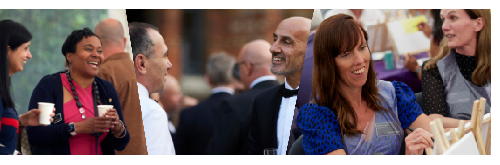
One of the common misconceptions of a model like ours is that people work alone. This could not be more wrong.

From day one our people are encouraged to collaborate with a global community of top-tier experts in just about every corporate and commercial discipline.